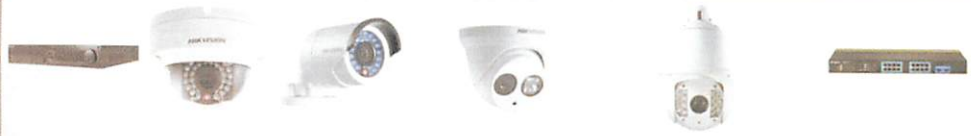
HIKVISION NVR VANDAL DOME BULLET CAMERA TURRET CAMERA PTZ CAMERA WITH SMART TRACK POE SWITCH