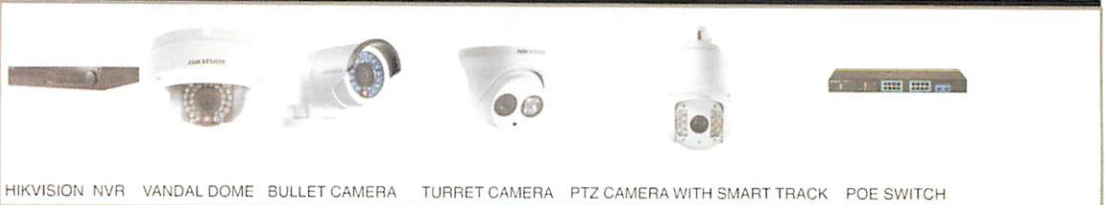
HIKVISION NVR VANDAL DOME BULLET CAMERA TURRET CAMERA PTZ CAMERA WITH SMART TRACK POE SWITCH